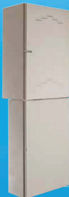
230DRA Series Meter Box

This HDU is not suitable for mounting wireless equipment.