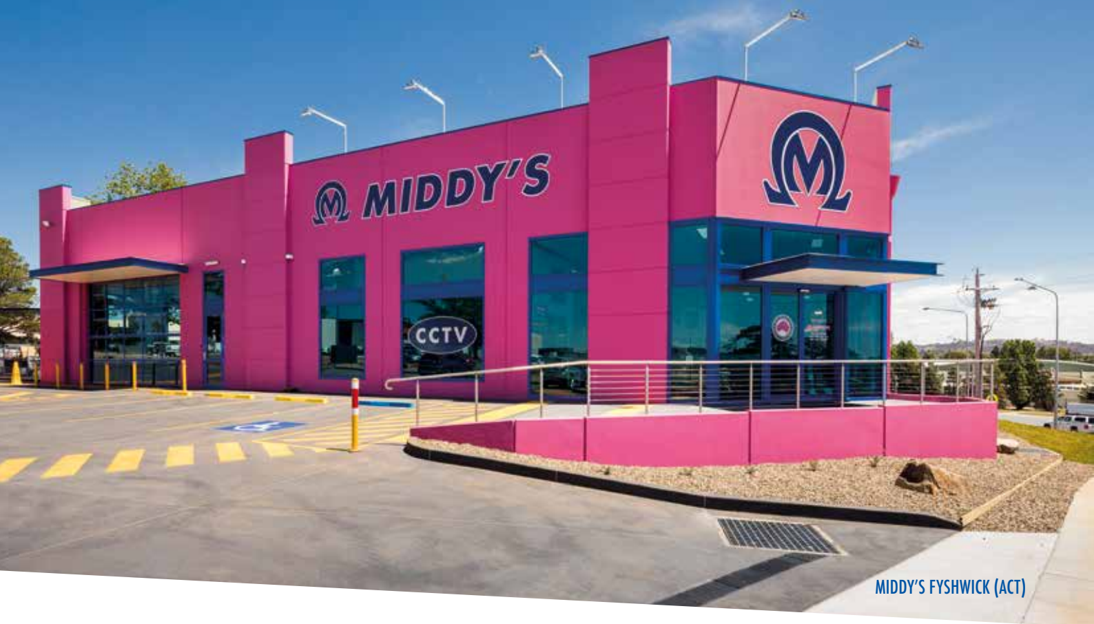
MIDDY'S FYSHWICK (ACT)