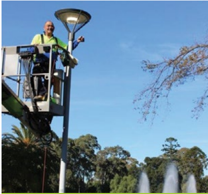
Thorn Avenue LEDs installed at Queen's Park, Moonee Valley